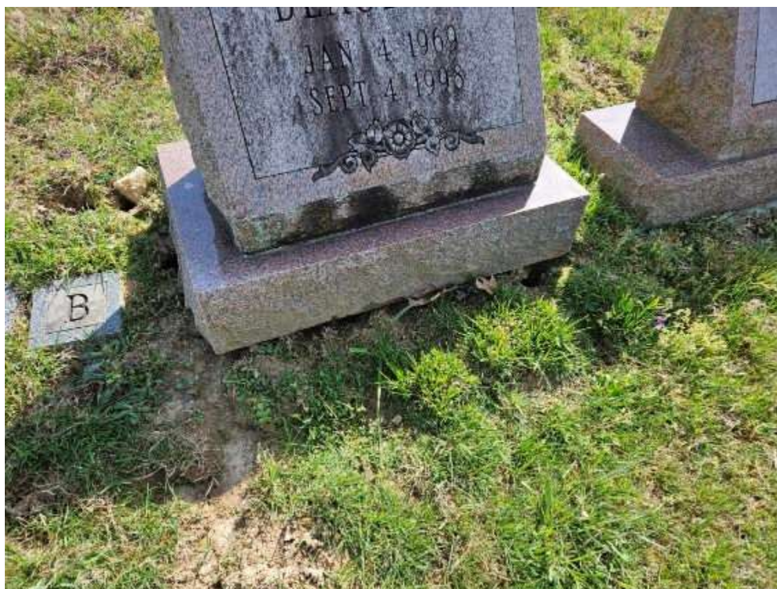
Beaudett Row 9 Lot 24