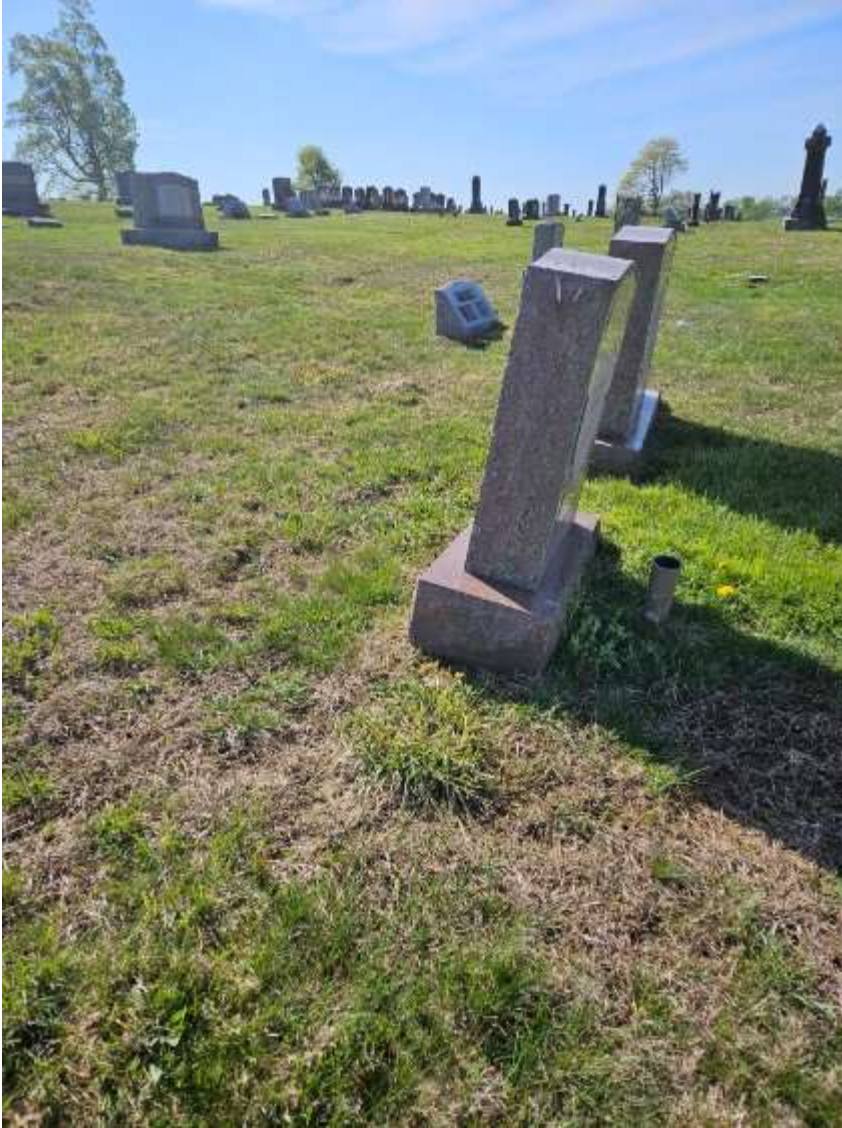
Williams Row 14 Lots 2 and 3