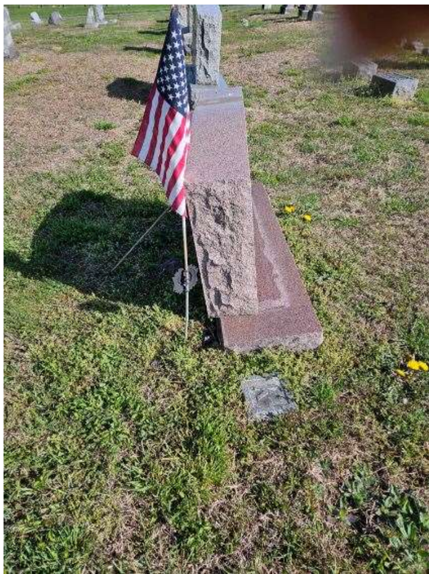
Kerr Row 13 Lot 10