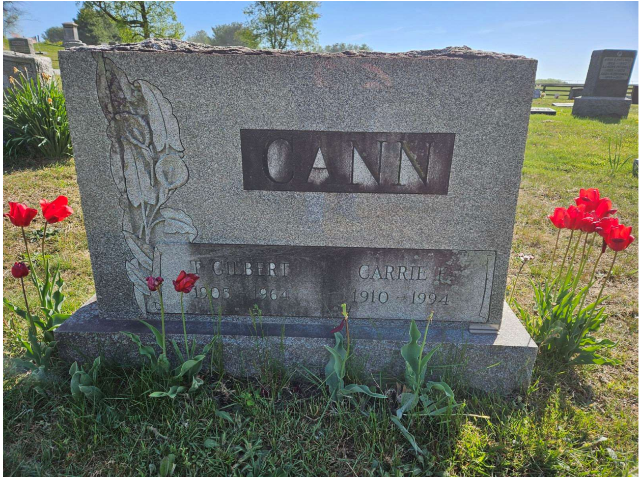
Gilber and Carrie Cann Row 13 Lot 7